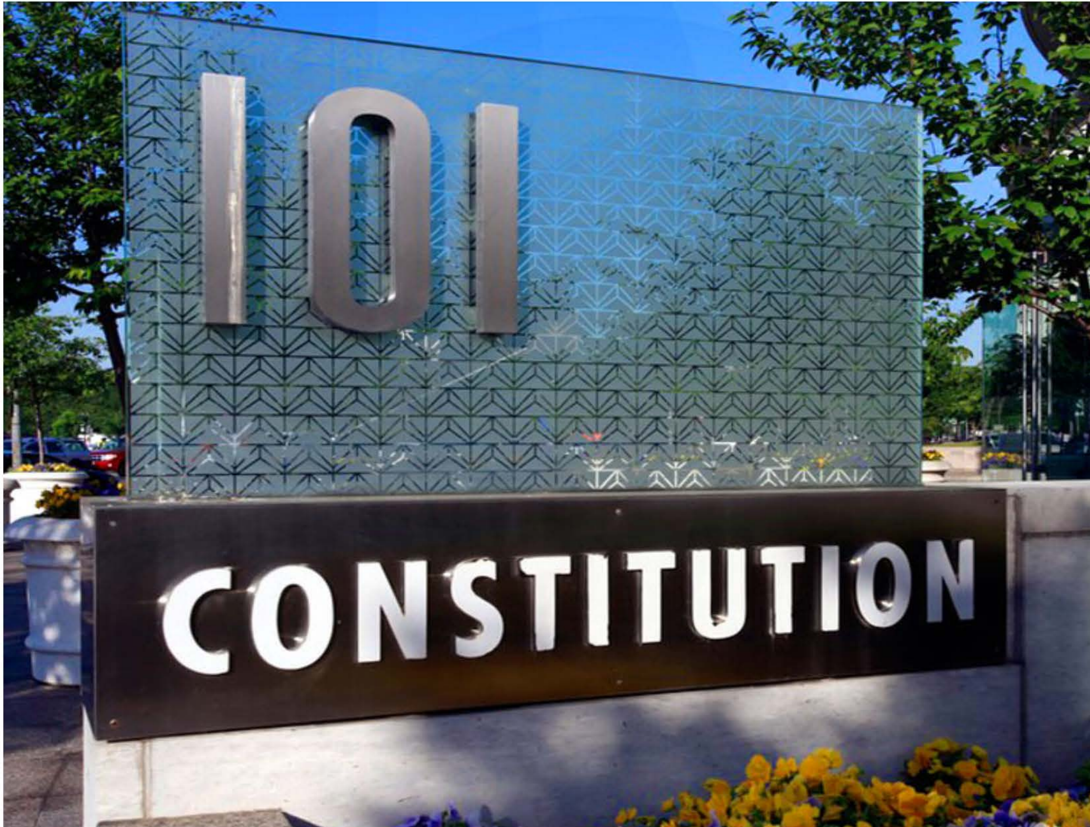
THE PARKING GARAGE AT 101 CONSTITUTION IS MANAGED BY SP+