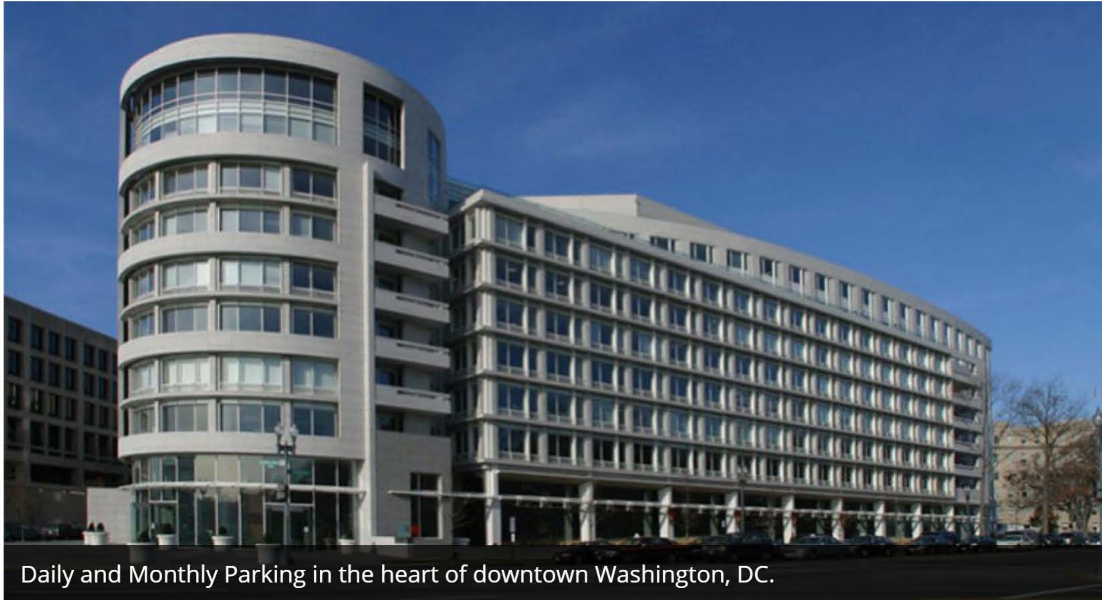
Daily and Monthly Parking in the heart of downtown Washington, DC.